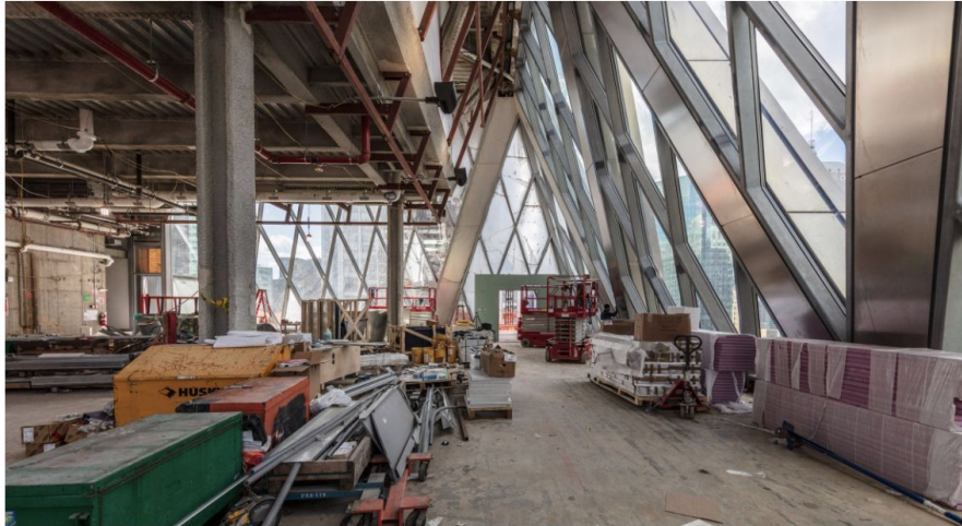
Triple-height spaces will divide the office floors

The recessed central section above this contains further offices and will be topped with a second triple-height space enclosed by a diagrid of columns.