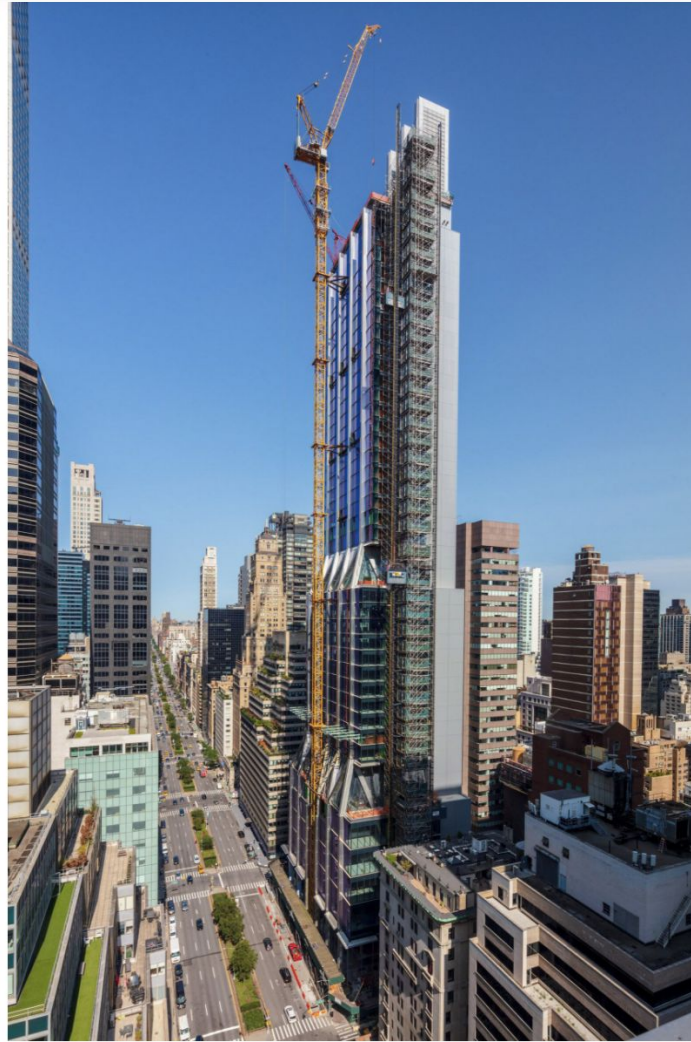
425 Park Avenue is nearing completion

The 41-storey office building occupies a full block on Park Avenue in midtown Manhattan near Rafael Viñoly Architects' super skinny 432 Park Avenue skyscraper and Philip Johnson and John Burgee's Postmodern AT&T Building.