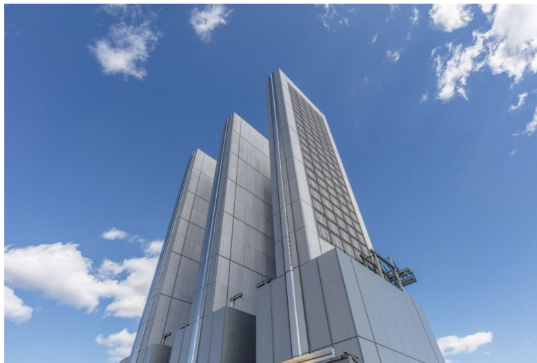
425 Park Avenue is topped with three ornamental steel and glass fins

According to the developer, the process of removing the skyscraper's exterior tower crane has begun and the temporary certificate of occupancy is expected in December.