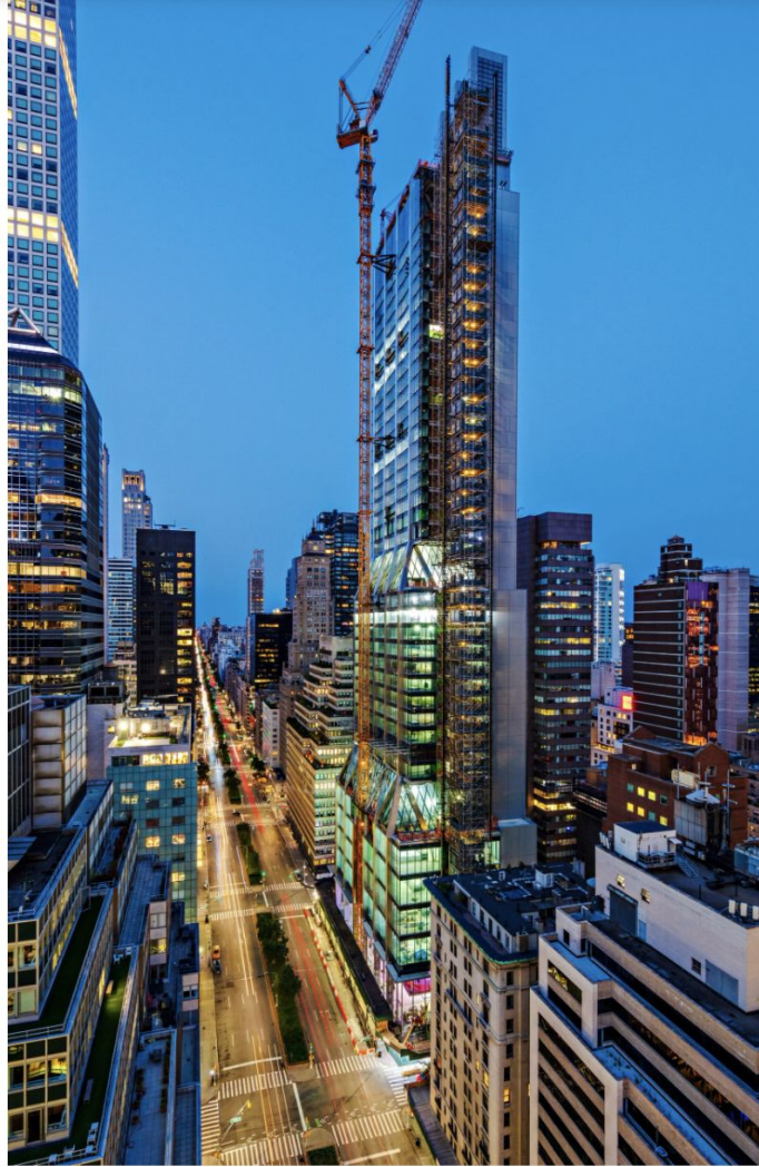
The skyscraper's cladding is complete

The skyscraper's seven-storey base contains a triple-height lobby for the offices above. It will contain a restaurant on the lowest three floors with above space above.