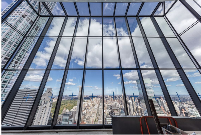
The penthouse space will have views across Manhattan

Photos also show the three ornamental steel and glass fins that are at the top of the building. These forms are now fully clad.