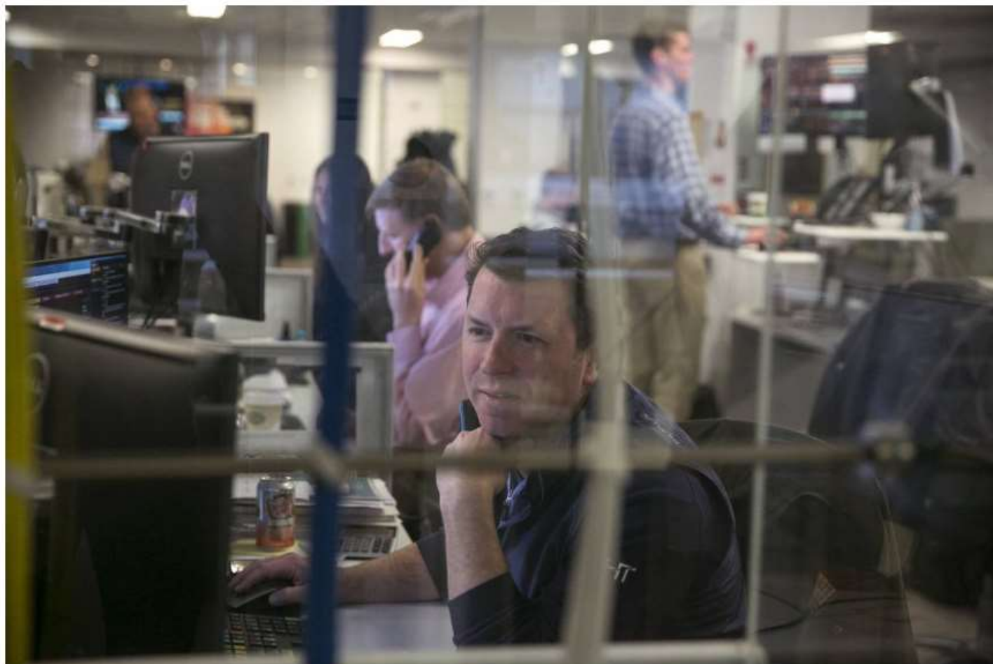
Liquidnet now has 250 to 300 employees located in a 100,000 square-foot Garment District office.